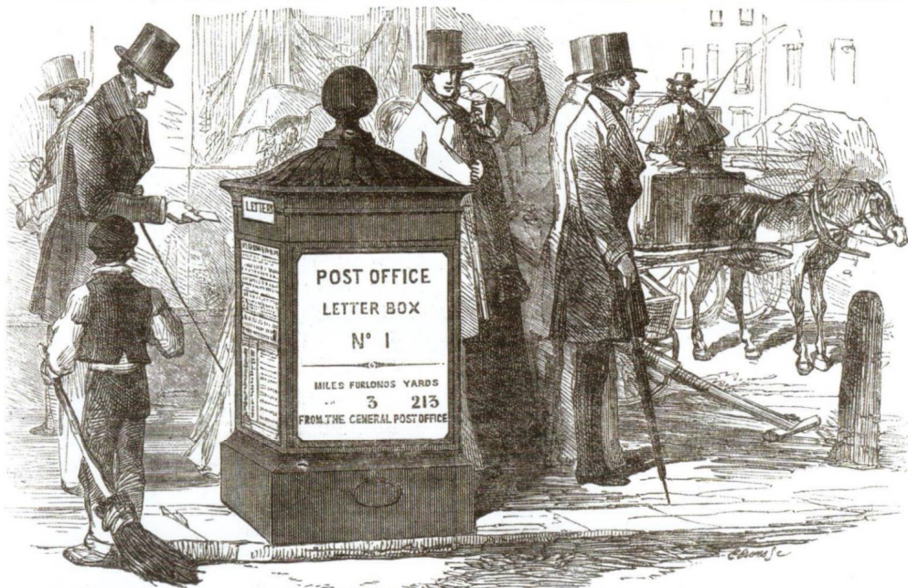
One of the first Post Office letter boxes, on the corner of Fleet Street and Farringdon Street, London, in 1855.

Anthony Trollope and posting boxes The introduction of roadside pillar boxes is credited to Anthony Trollope, better-known as a novelist. Less well-known is the fact that he worked for the Post Office, starting in 1834 as a clerk in the Secretary's Office on a salary of £90 a year. He did not enjoy the work and seven years later, he applied to become one of a new body of surveyors' clerks who travelled the country investigating complaints about postal matters. He was appointed to work in Ireland, and during this period he began to write, although at first with little success. Later he became a Surveyor and worked for a while in Egypt and the West Indies. He left the PO in 1867 to concentrate on his literary work.